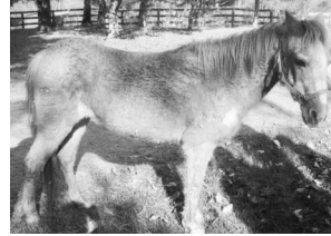
Pebbles upon arrival - November 07 - thin and sick